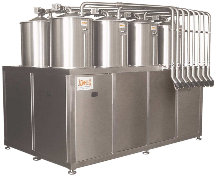
Micro-ingredient system for the storage and dosing of powdered micro-components