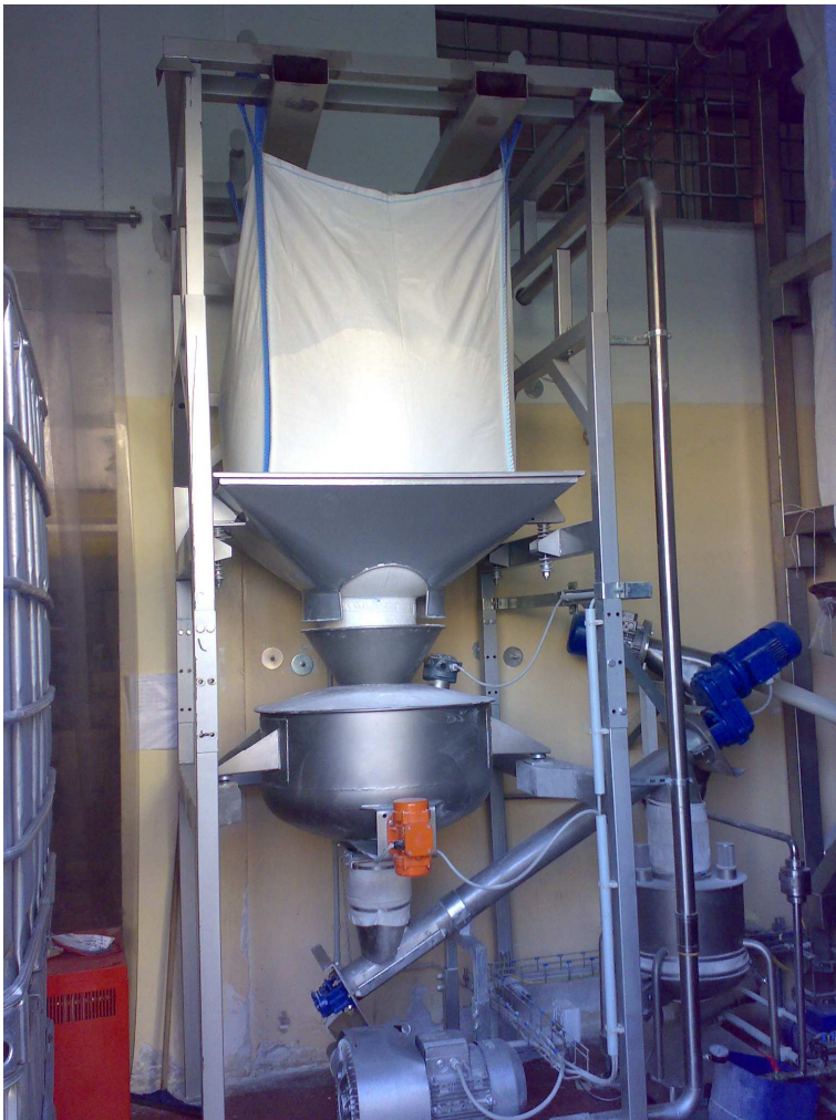
Big bag emptier