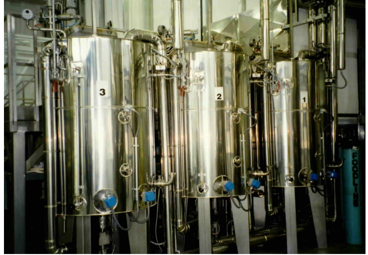
Liquid storage and dosing (oil, salt solution, glucose, malt, eggs, etc.)