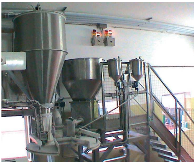
Dosing station for powdered products, liquids and fat