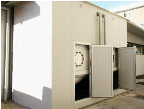
Fabric silos in Trevira type high tenacity fabric suitable for internal storing of powder products