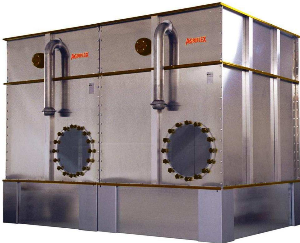
Fluidized steel silo with modular panels in stainless steel for internal storing of powder products